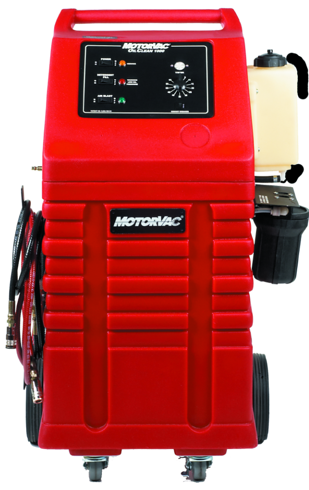
Part No. 500-6050